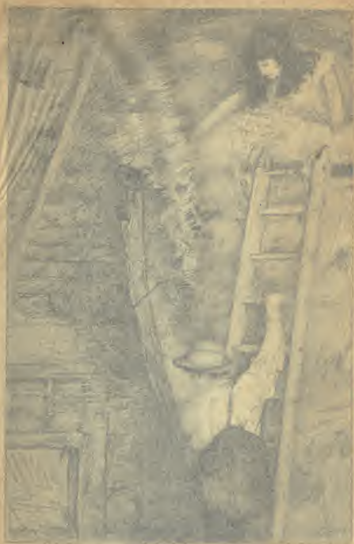
'She saved Robin, hurrying up the ladder.'